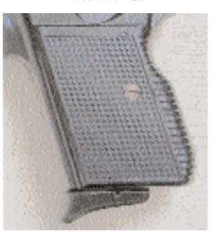
The magazine properly installed in position.