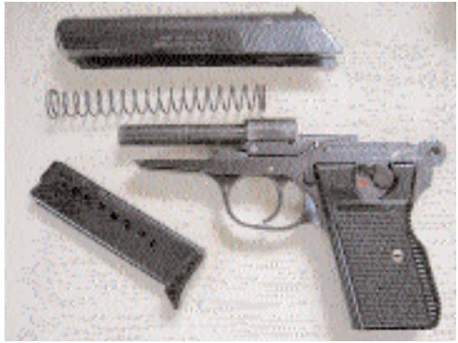
The Century Czech Model 70 pistol disassembled into its major component parts groups. No further disassembly is needed for routine maintenance.