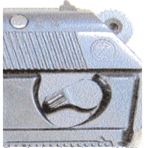
The safety lever in the lower or "SAFE" position. The pistol cannot be fired.